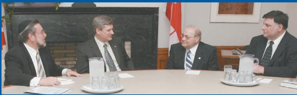
B'nai Brith leaders discuss Canada's Jewish Community agenda with Prime Minister Harper